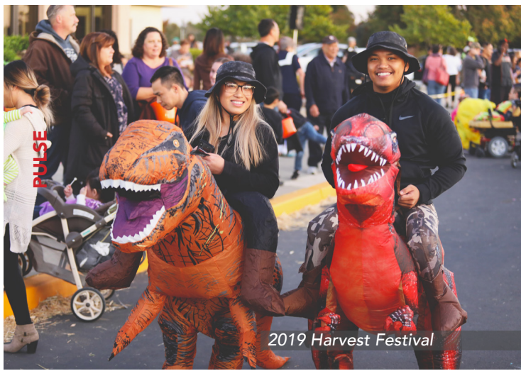
2019 Harvest Festival