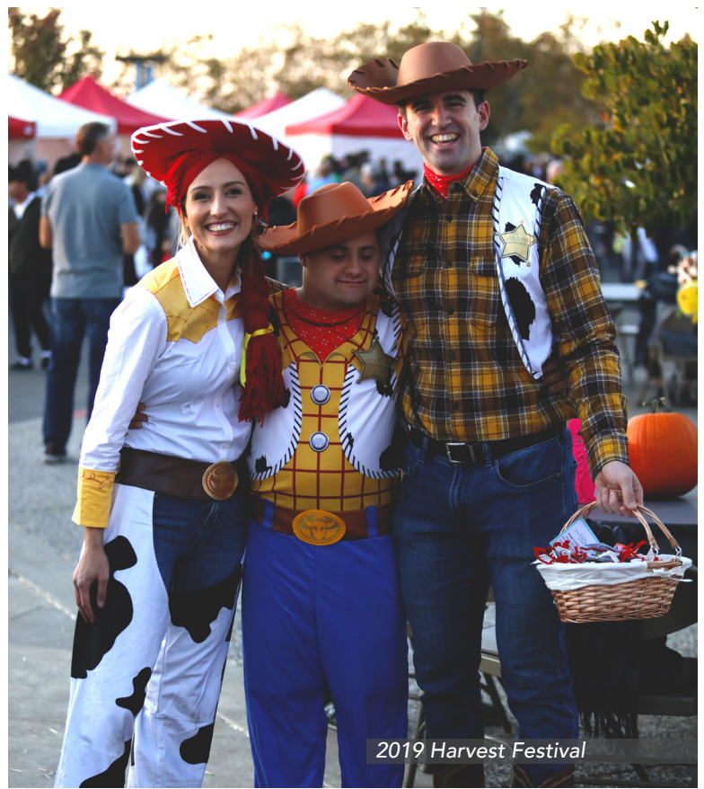
2019 Harvest Festival