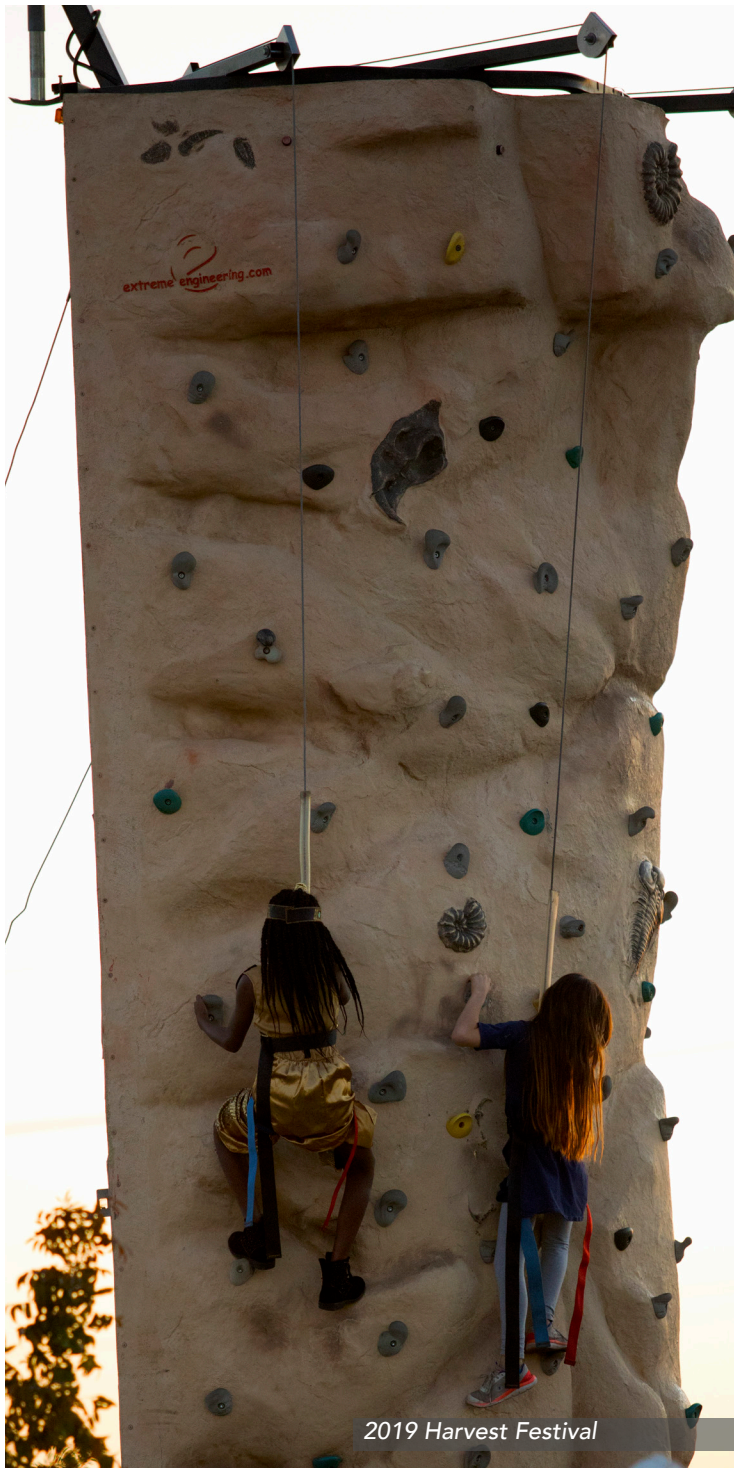
2019 Harvest Festival

“ Thanks for a fantastic night! Every year gets even better! Love our church! ”