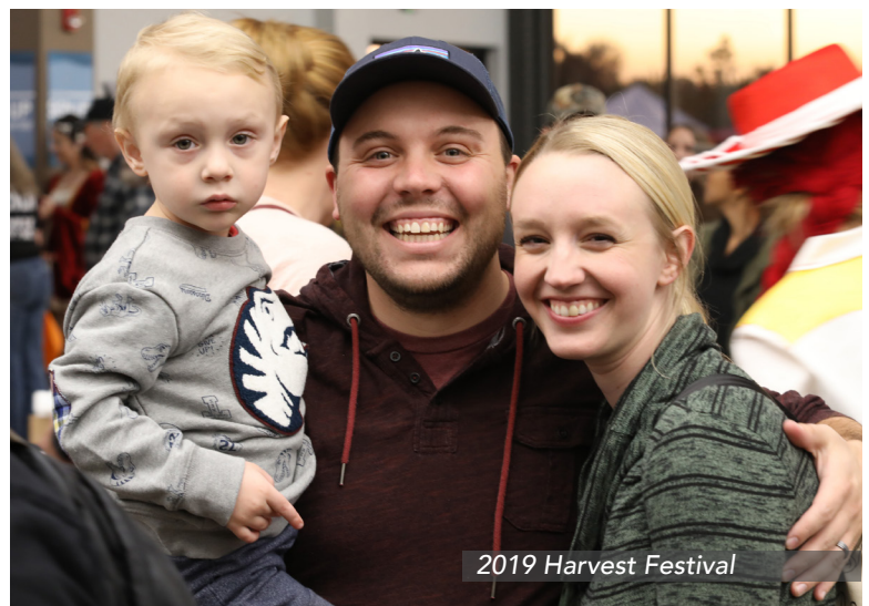
2019 Harvest Festival